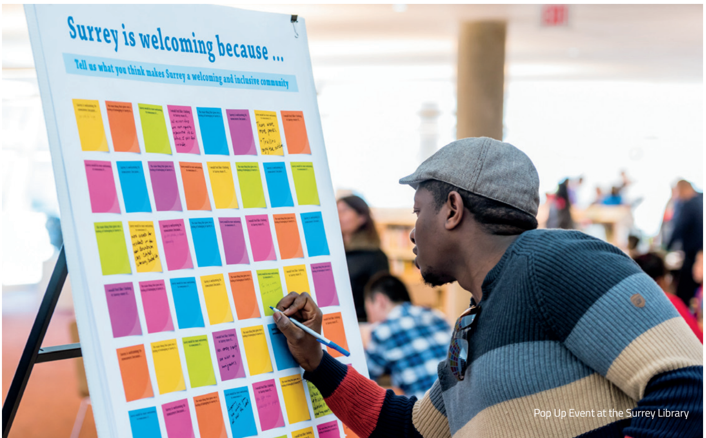
Pop Up Event at the Surrey Library